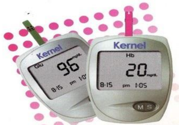
Single Instrument - 2 Parameters